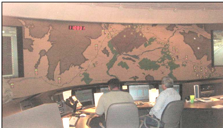
Visiting with the operators in the control room was a highlight of our recent field trip to the headquarters of the Central Arizona Project.